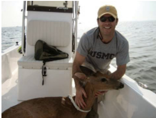
Who felt luckier, the deer, or the fisherman?

The largest population in the UK of around 40 seahorses, including pregnant males, was discovered in Studland Bay last summer. The Seahorse Trust wants further protection for seahorses in Studland Bay, due to concerns that the species may be threatened by boats in the area ripping up eelgrass which the seahorses rely on.