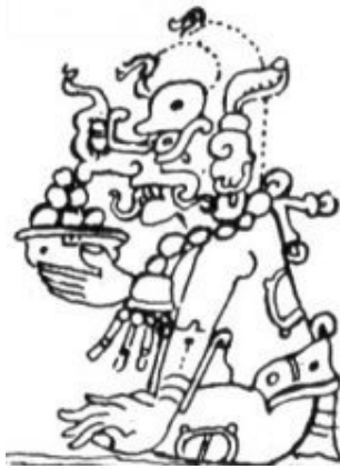
Mayan gods like this may have been worshipped in Lake Atitlan.

The exact location of the site is a closely guarded secret, since the archaeologists want to protect it from looters who fish in the ruins for artifacts to be sold, sometimes for thousands of dollars, on the black market.