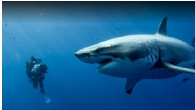
Still from "Oceans"

Sorry, but no refunds will be made for reservations cancelled less than one week in advance.